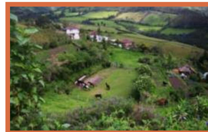
Casa Mojanda grounds