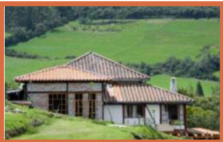
Nestled on the hillside