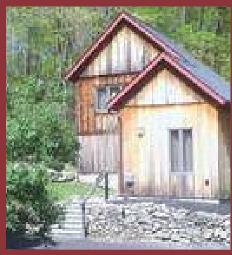
Your cottage awaits