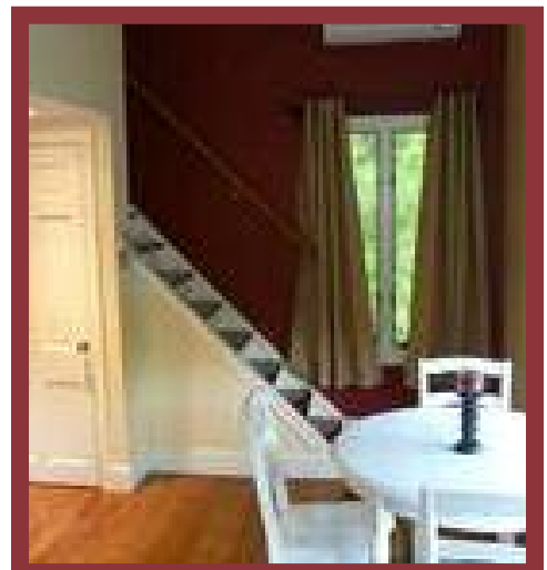
Stairway to heaven