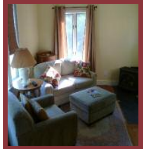
Cozy sitting area

Website: www.airbnb.com/rooms/1042243?s=CdPbUUTa