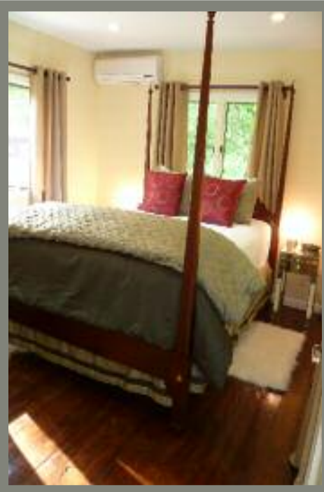
Comfy four-poster bed