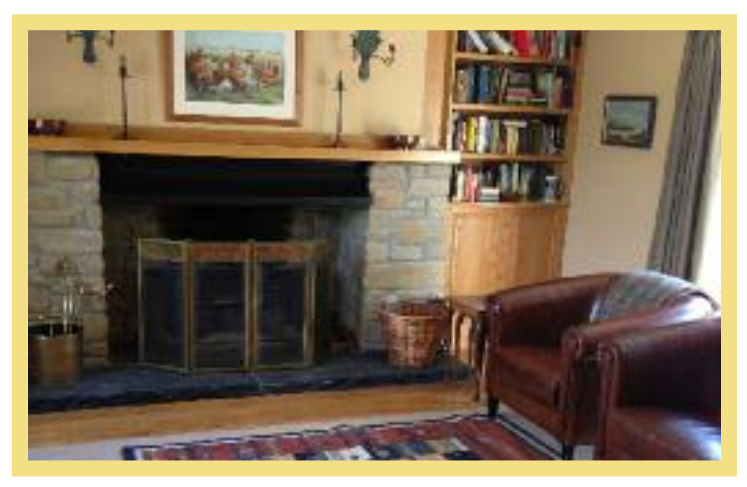
Sitting room with fireplace