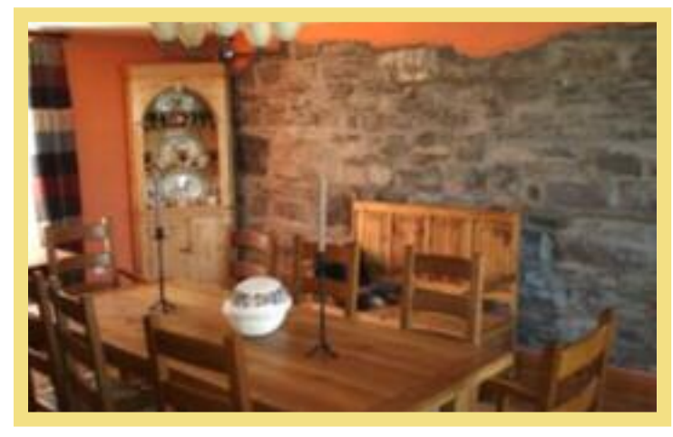
Dining room with fireplace