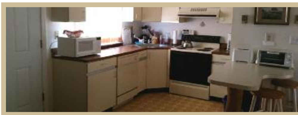
Full kitchen with appliances