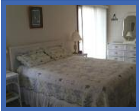
Bedroom 1 - Queen