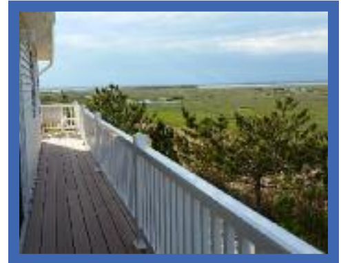
The side deck