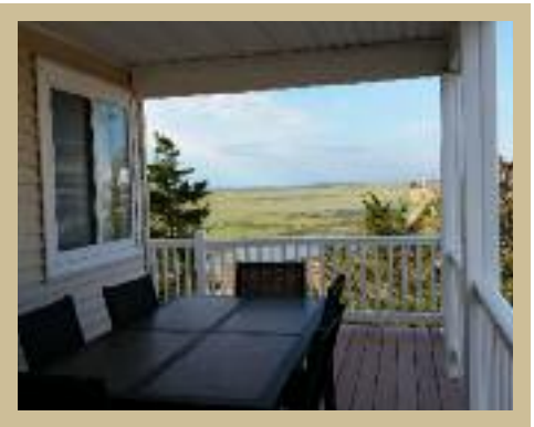
The front deck