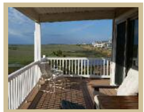
The back deck

Restrictions: Sept-Oct '16, April-mid June '17 subject to availability.