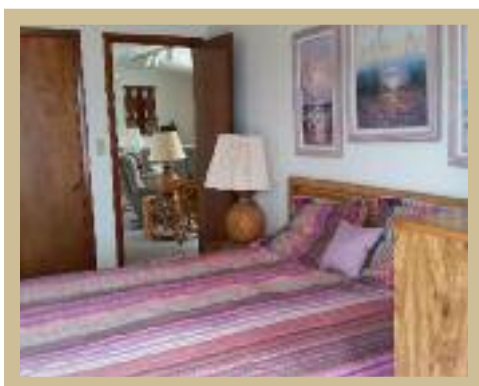
Bedroom 2 - Queen